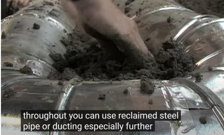
throughout you can use reclaimed steel pipe or ducting especially further