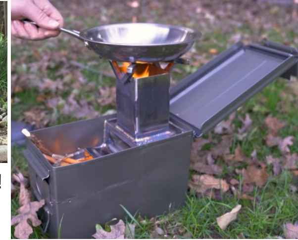
Even use empty ammo cans! Video and plans © Justin Voss

https://www.youtube.com/watch?v=zg-4viTrBkQ https://defiantmetal.com/collections/project-plans