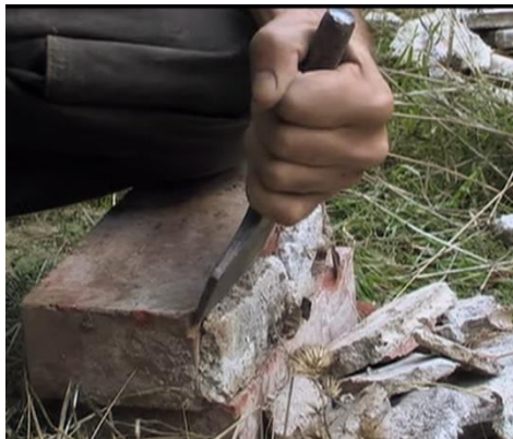
From rubble to heat-holding mass

Recycled bricks, concrete chunks, steel barrels, ducting, metal, rocks, and more can be used.