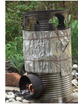
Used metal cans make great portable stoves!