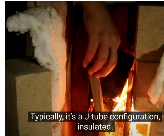
Typically, it's a J-tube configuration, insulated.

Cost? almost $0 - $300 for simple designs